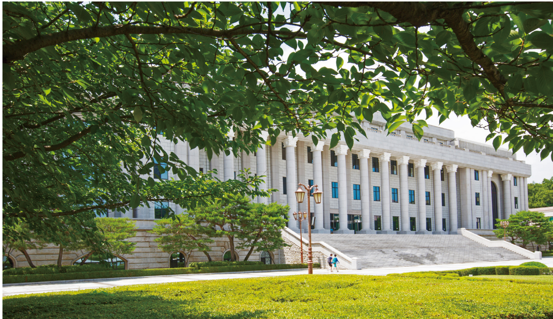
| Summer Central Library (University Administration Hall)