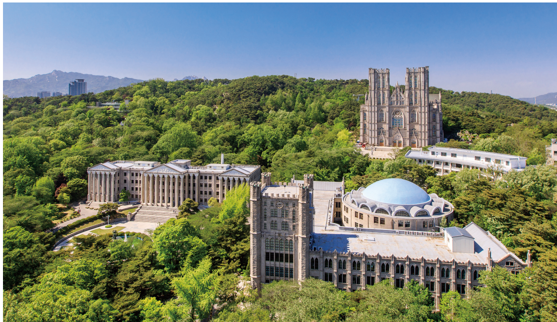
| Summer Seoul Campus scenery